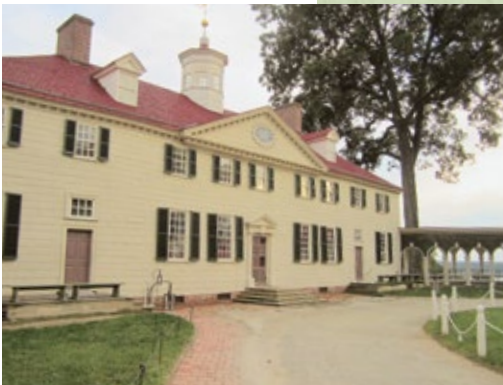
Mount Vernon was one stop on the leadership trip.

Being a part of Plains Land Bank means that we are all a part of something so much bigger. We are a part of an organization that is striving to protect the way we live as farmers and ranchers who know that agriculture is a fundamental pillar in our society. I love and appreciate Farm Credit. From our farms to our home, Farm Credit has been making my family's dreams come true for generations. I am so incredibly grateful to have been able to participate in this leadership program, and to have the opportunity to meet and personally thank so many of the people who have changed our lives.