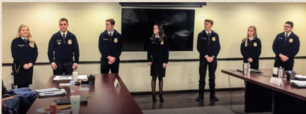
The Canyon FFA Agricultural Issues team makes a presentation to the Plains Land Bank Board of Directors on the impact of migrant workers on the economy.

The Canyon FFA agricultural issues team stopped by the Plains Land Bank boardroom to present their agricultural "issue" before heading to the state competition. The team's presentation included both a pro and a con side on the impact of migrant workers on the U.S. agriculture economy. The team placed first at the district and area competitions and took home second at the state level.