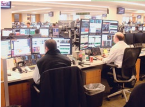
Association leaders visited a stock trading firm in New York City.