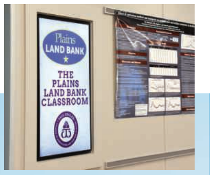
In gratitude for Plains Land Bank's $150,000 donation to WTAMU's new agricultural sciences complex, the agricultural college named a new classroom for the lending co-op.

All of these features will allow WTAMU to graduate students better prepared for working in the agriculture community and better equipped to improve our community as a whole.